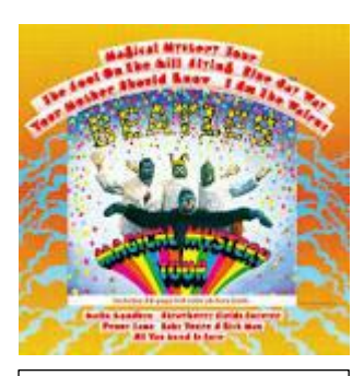
Magical Mystery Tour 1967