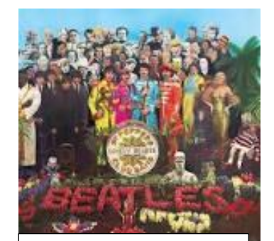
Sgt. Peppers Lonely Hearts Club Band, 1967